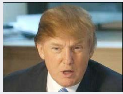
Donald Trump: coping with more casino woes.

The state of New Jersey, which is owed $11.6 million in various taxes, contends that Trump's plan to make deferred semi-annual cash payments plus 4 percent interest is inadequate. Under New