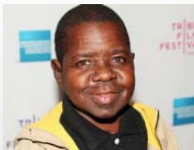
Stars We Lost 2010