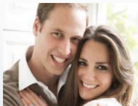
Celebrity Circuit's Crystal Ball