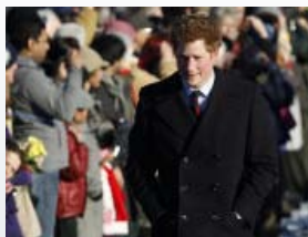
Holidays at the World's Palaces