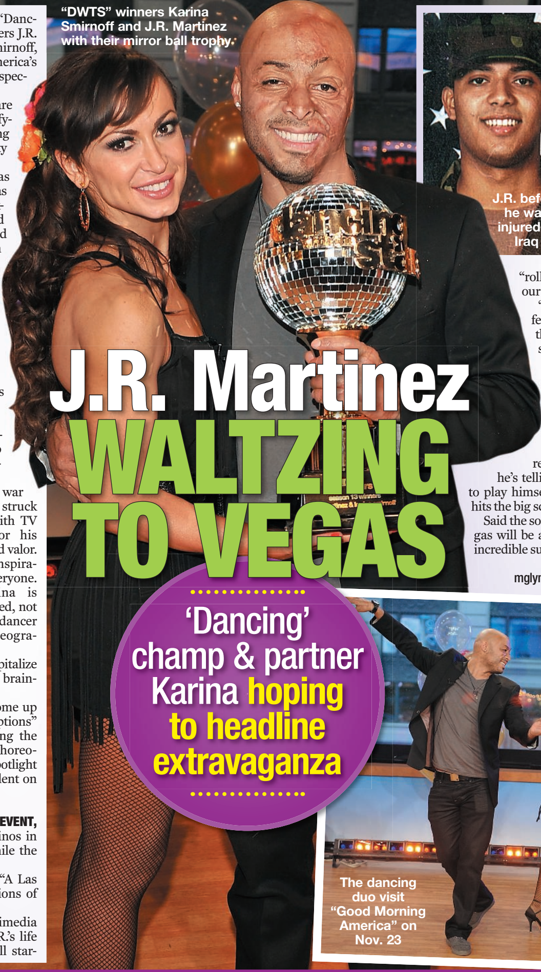
"DWTS" winners Karina Smirnoff and J.R. Martinez with their mirror ball trophy.

"It could include a multimedia show, taking you through J.R.'s life from his high school football star-