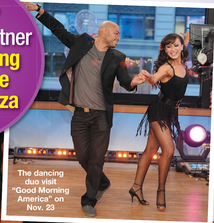
The dancing duo visit "Good Morning America" on Nov. 23